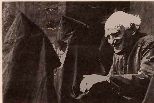
Jannedor (left) meets Prince Herbert the Not Quite in happier times

This threat is a banana-skin under Aquitania which will boomerang like a rabid quagmire before coming home to