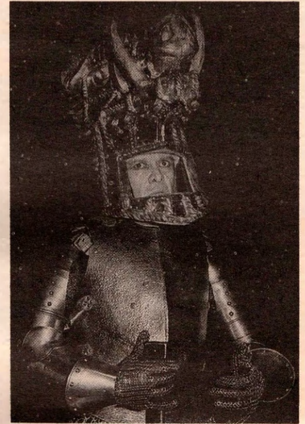
King Derek the Confused at the Battle of Duvet

Some fifty years leater, the Guardians were in action again, fighting for King Derek the Confused against himself in one of the great rearguard actions of the Silly War. Contemporary sources cite the Guardians' role as "negligible: They just Hange aroundd with much Drinking and Fondling.