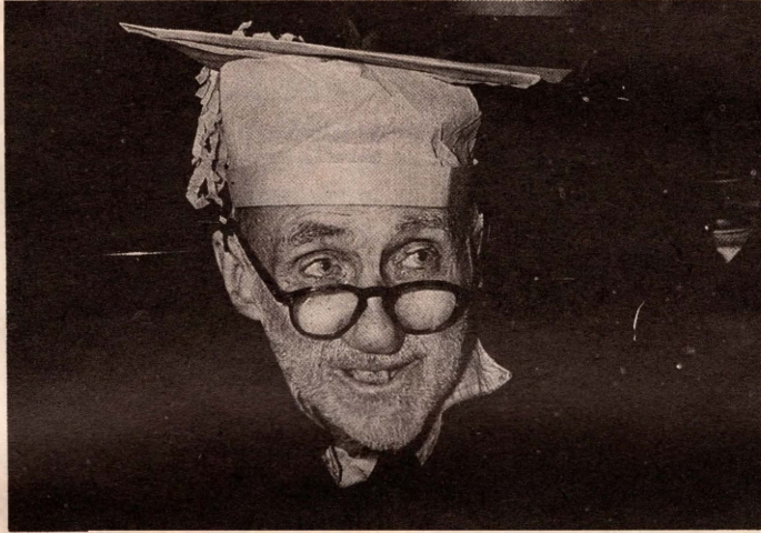
Starborgling: "No cause for alarm."

The Jannedor threat was first brought to the at-