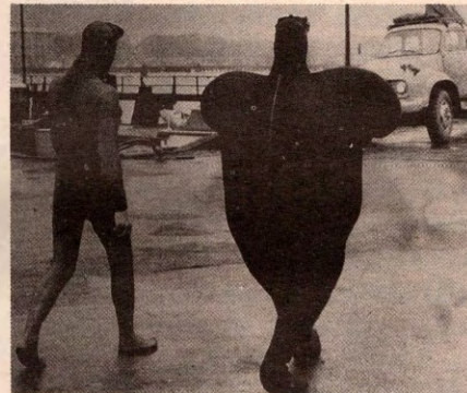
The Kwazi Delegation